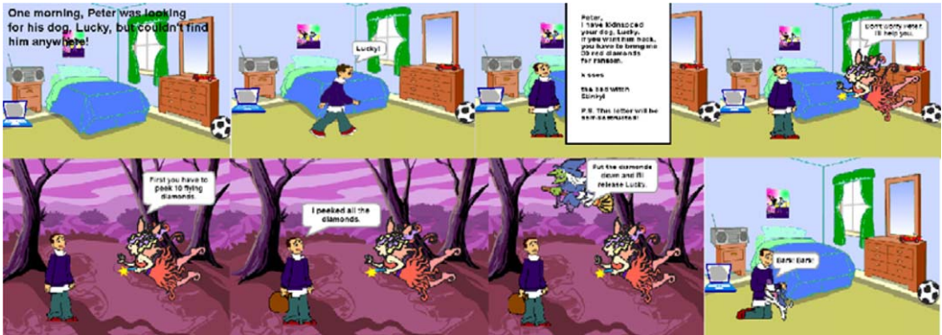
Figure 1: Screenshots of storytelling in the Gem Game

been kidnapped). By solving problems, the main character has to collect 30 diamonds to win the game. The game's format incorporates narrative elements aimed at motivating players (Bopp, 2007).