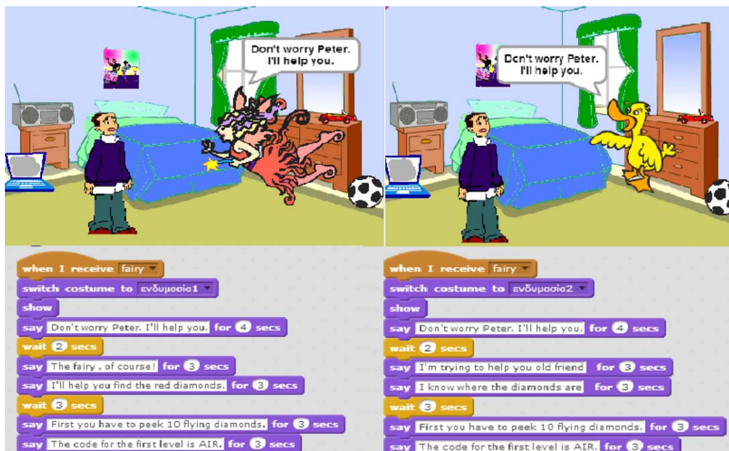
Figure 3: Example of how students altered the game scenario in the scratch environment and part of the code's modification

The empirical study was conducted in the context of secondary education. The respective maths unit and the use of a programming environment were part of the curriculum. The research was conducted 2 weeks after the students had finished the relevant maths unit at school. Students used the scratch environment to play games for 1 hour to become familiar with it, as well as with using video games. Moreover, the Scratch programming environment could be used for both playing and programming. From this perspective, the code-modification parameter could be easily explored.