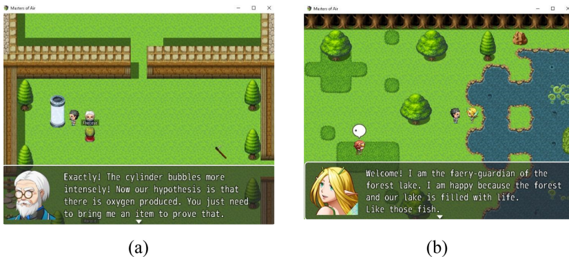
Fig. 3. Cooperative activities promote teamwork through coordination and communication. (a) Players observe the experiment. (b) Players walk in the forest to observe and learn content.

Additionally, some activities promote group work differently. In this viewpoint, PCs are on the same map, attending the same events. However, these cooperative activities have a free character meaning that one PC can perform the assigned tasks or watch the others complete them [4, 5] (Fig. 3).