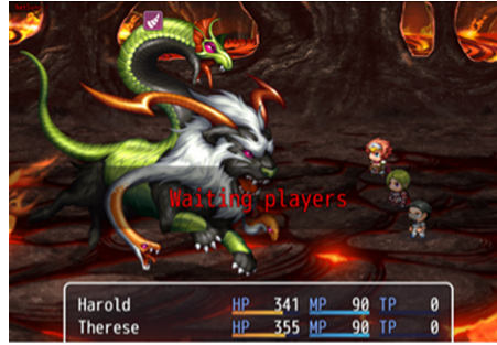
Fig. 4. Warning message

Players mentioned that “in case of not coordinated actions, they should start all over again,” as the need for coordination influences the game track advancement. Players who use the SAIR must transfer all together to the following map [5]. Adventure games allow a serial game plot, according to the content of a book [2]. In this direction, the MSGM suggests the integration of the science’s book educational content in the gameplay mechanics [4]. Therefore, the game design wants all players to move to the following map together. However, it seems that the “group traveling” needs a more careful design.